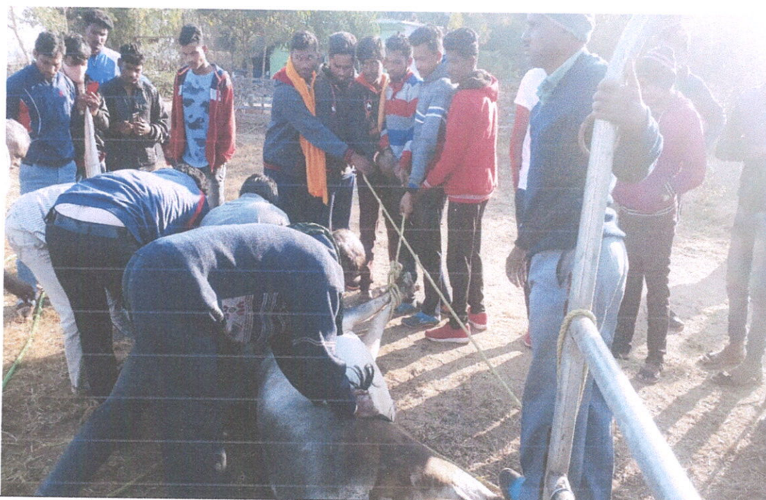
Treating cattle at the camp